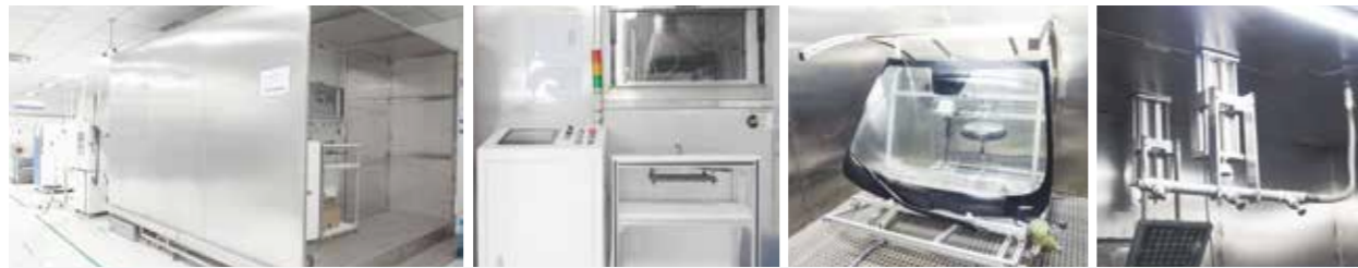
光雨量测试台架 RLS Test Bench