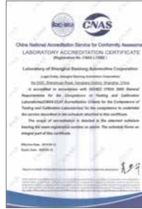
保隆汽车电子实验室 CNAS认证 CNAS L12065 Baolong Automotive