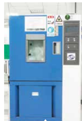
高低温湿箱 Climate and Humidity Chamber