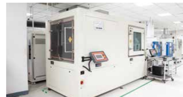
防水试验台 Water Proof Test Rig