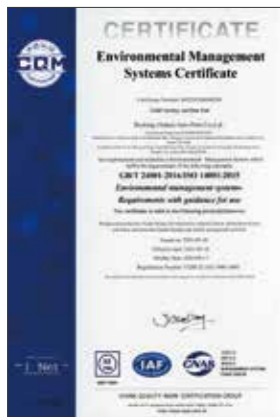
保隆安徽汽车配件有限公司 ISO 14001环境管理体系认证 ISO 14001 Ningguo Branch