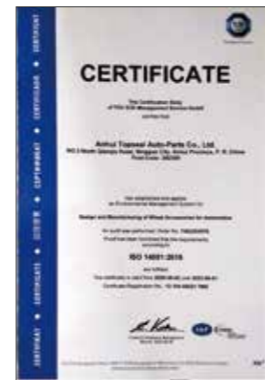
保隆安徽拓扑思汽车零部件有限公司 ISO 14001环境管理体系认证 ISO 14001 Anhui Plant