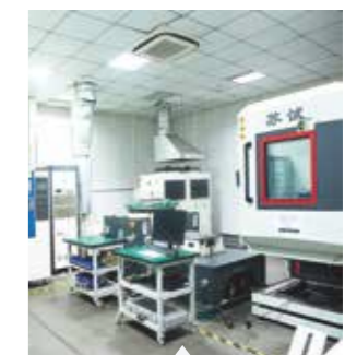
高低温复合振动台 Climate Combined Vibration Test Bench