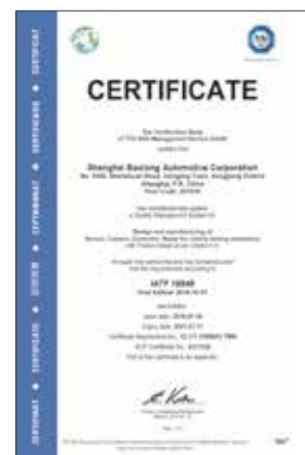
保隆科技 IATF 16949质量体系认证 IATF 16949 Baolong Automotive