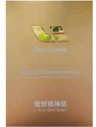
理想精神奖 Li Auto Spirit Award