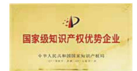
国家级知识产权优势企业 National Intellectual Property Advantage Enterprise