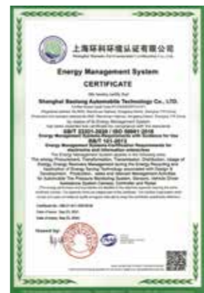
保隆科技 汽车能源管理证书 Energy Management System Certificate