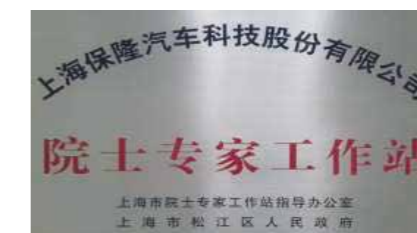
院士专家工作站 Academician Expert Workstation