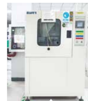
灰尘试验箱 Dust Chamber