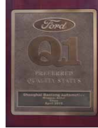
福特Q1质量体系认证证书 Ford Q1 Preferred Quality Status