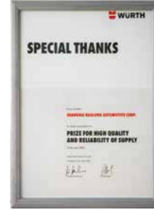
伍尔特A级供应商 Wurth Grade "A" Supplier