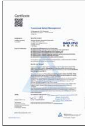
保隆科技 ISO 26262功能安全管理体系认证证书 ISO 26262 Baolong Automotive