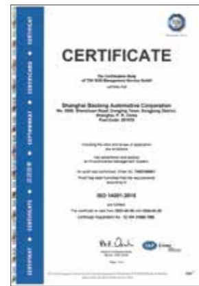
保隆科技 ISO 14001环境管理体系认证 ISO 14001 Baolong Automotive