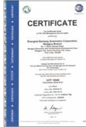
保隆科技宁国分公司 IATF 16949 质量体系认证 IATF 16949 Ningguo Branch