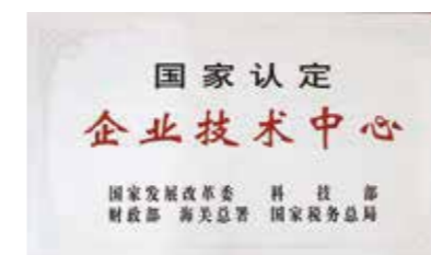
国家认定企业技术中心 National-recognized Enterprise Technology Center