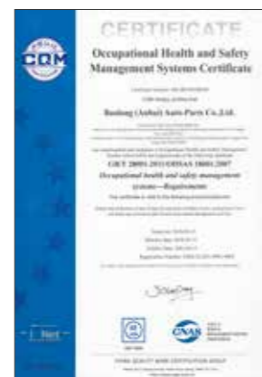
保隆科技安徽宁国分公司 OHSAS 职业健康安全管理体系认证证书 OHSAS Anhui Plant