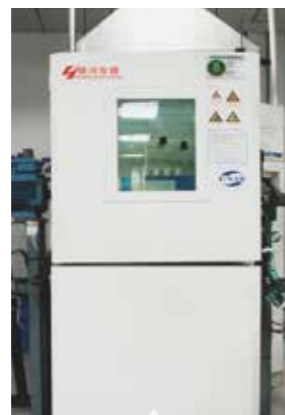
旋转式高低温湿箱 Rotatory Climate and Humidity Chamber