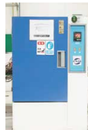
干燥箱 Drying Oven