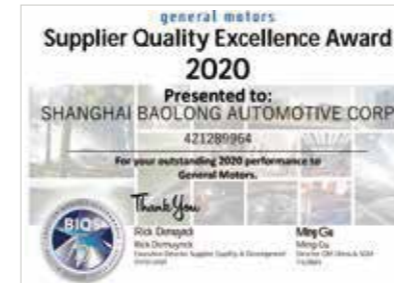
通用汽车供应商质量卓越奖 GM Supplier Quality Excellence Award