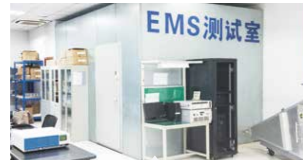
EMS 测试室 EMS Lab