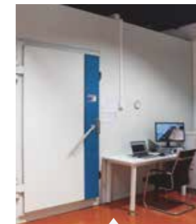
BCI测试系统 BCI Test System