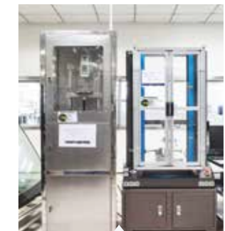
拉压力计 Tension Pressure Gauge