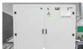
传感器液压疲劳测控系统 Sensor Liquid Pressure Fatigue Test System