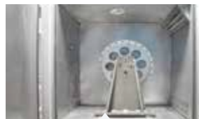
高低温复合旋转台 Climate Combined Rotation Test Bench