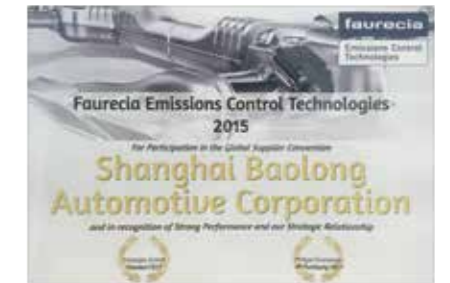
佛吉亚全球供应商 Faurecia Global Supplier