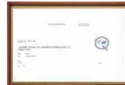
大众A级供应商 Volkswagen Grade "A" Supplier